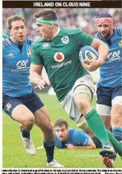
IRELAND ON CLOUD NINE

THE 11th day of the election campaign has seen a significant swing in the polls. The latest survey by the Sunday Times shows that the Fianna Fáil lead has widened to 11 points, up from 8 points in the previous survey. This comes as the campaign enters its final stages, with both major parties vying for the support of undecided voters. The survey also indicates that the public is becoming increasingly disillusioned with the current political establishment, leading to a surge in support for smaller parties.